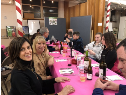
More Dinner Dance Photos...