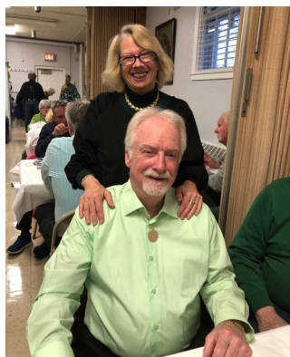
More St. Patty Day Dinner Photos...